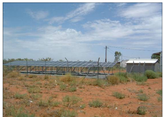
Bushlight array and shed at Irrerlirre