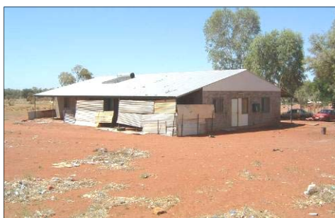
Pensioners' House at Irrerlirre

were purchasing another jerry can of fuel from a nearby station to supplement this supply. The fuel use pattern observed during this time was that the generator was run continuously from when fuel arrived until it was used up. Effectively, this meant the community had power each Tuesday day and night, and then no power for the rest of the week, unless another jerry can was purchased. This amounted to a total annual fuel consumption of 3210 Litres (~$4400/year).