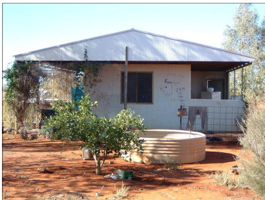
House 1 at Karrinyarra (June 2005)