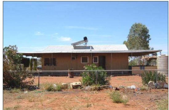
Dudley and Jill's House, Irrerlirre

The results of the v1.6 trial show an increase in power use by residents that is within the increased EMU limits. The latest data results show that the system handles the increased budgets well and this includes positive data captured during a period of extended low solar insolation.