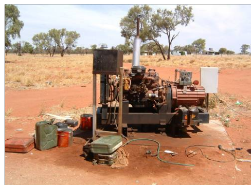
Prior generator at Irrerlirre

When the community began to report loss of discretionary power, Bushlight decided to see what options there were for alleviating the problem. Looking at the situation at Karrinyarra led the design team to rewrite the original EMU design tool which resulted in larger energy budgets being produced. The other change at Karrinyarra was a recognition by Bushlight that the refrigeration loads allowance