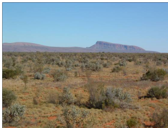
Mt Wedge near Karrinyarra

Prior to the installation of the Bushlight renewable energy (RE) system Karrinyarra residents relied on a 5kW single phase generator to power the community for an average of four hours a day. A 20 Litre jerry can of diesel was used each day, purchased either from a nearby roadhouse on the Tanami Highway, or from Yuendumu, or Alice Springs. The generator provided energy to each of the three houses via extension leads as required. Prior to the installation of the Bushlight system residents spent an average of $10,920 per year on diesel.