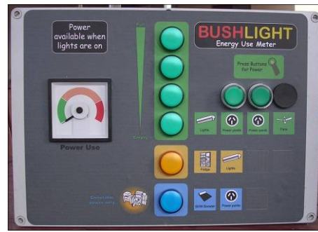
Bushlight Energy Management Unit

Karrinyarra have long struggled to receive a consistent level of assistance from Service Providers in the region. With the facilitation of Bushlight a relationship was established with Papunya Community Government Council to administer user contributions (community payments toward the long-term replacement of RE system parts). This arrangement faltered and at the time of the 12 month review Karrinyarra was effectively on its own in terms of general service provision for the community and had chosen to stop paying user contributions.