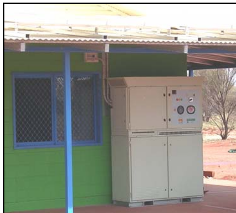
Bushlight Household System capable of producing 5.6 kWh/day

equipment, two service visits in the first 12 months and modifications to the existing house wiring. The NTG's Renewable Energy Rebate Program provided a rebate of approximately $33,962 on the total system cost.